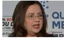
Premier breaks down during debate