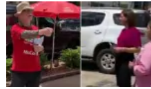
Fiery shouting match at voting booth

They have argued that the president did nothing wrong in his dealings with Ukraine and that US voters - not Congress - should decide his fate.