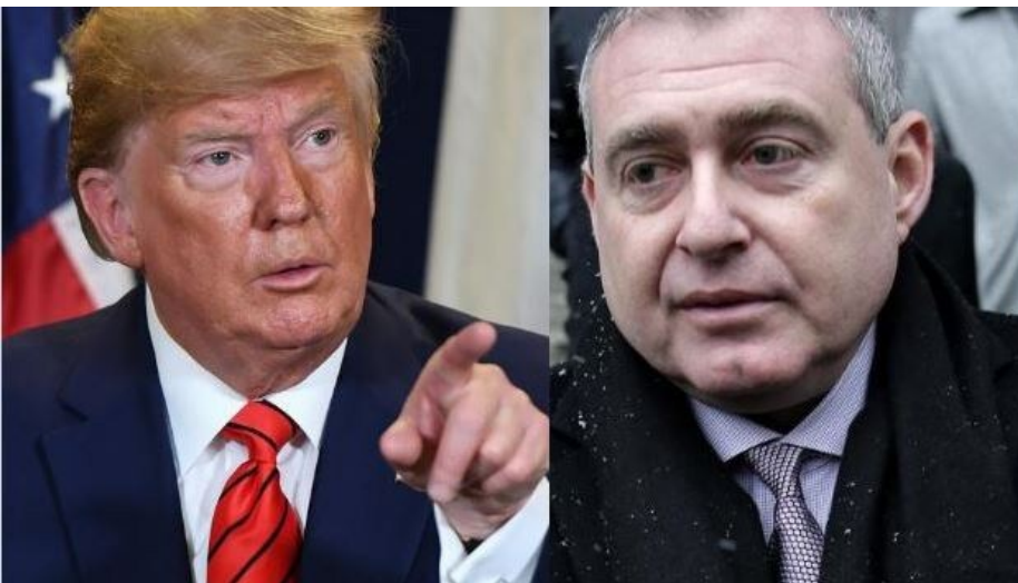
Donald Trump, left, and Rudy Giuliani associate Lev Parnas.

US President Donald Trump demanded the dismissal of Marie Yovanovitch, the ambassador to Ukraine and a key figure in his impeachment trial, according to a video recording released to the media on the weekend.