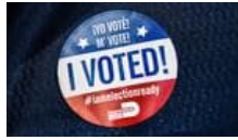
Bizarre element of US voting explained