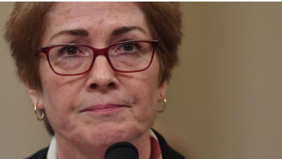
Former US Ambassador to the Ukraine Marie Yovanovitch testifies before the House Permanent Select Committee on Intelligence as part of the impeachment enquiry into US President Donald Trump, on Capitol Hill on November 15, 2019 in Washington DC.

"Get her out tomorrow. I don't care. Get her out tomorrow. Take her out. OK? Do it."