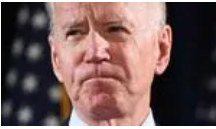
Thing that could sink Joe Biden

The release of the tape increases pressure on US senators to subpoena witnesses for the impeachment trial. a move several polls show has str MORE IN WORK on the US