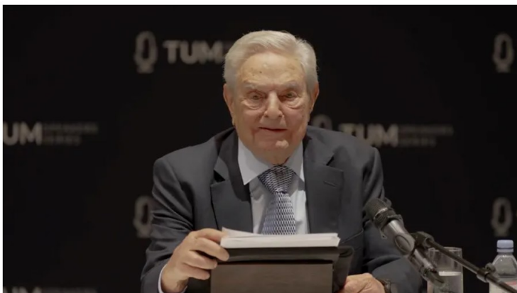
George Soros delivers a speech during the 2023 Munich Security Conference.