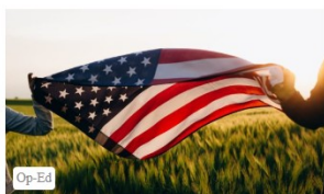
Galeanu Mihai / Getty Images