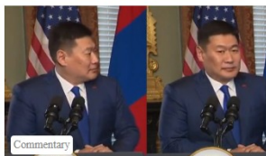
@RNCResearch / Twitter Screen Shot