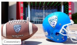
Louis Grasse / Getty Images