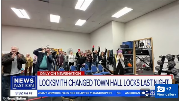
Voters at a watch party celebrate as the results of the recall election are announced

The lawmakers claimed that despite Germany's Volkswagen AG being the largest single shareholder at about 30 percent of Gotion's parent company, Gotion High-Tech, China maintained 'effective control' through multiple individual shareholders.