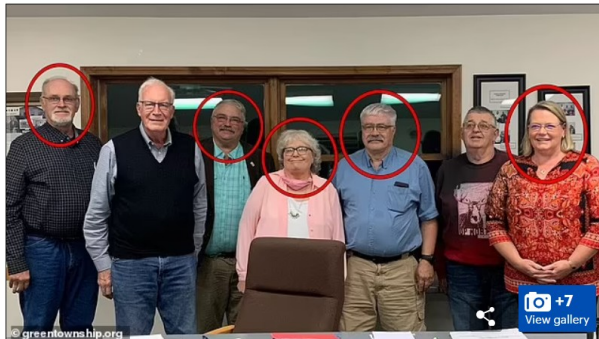
Voters in Green Charter Township, Michigan, on Tuesday recalled all five town board members (circled) over their support of a Chinese-affiliated company's plans for a battery plant

Although it is backed by Volkswagen with operations in Germany, Gotion's parent company is based in China, and has been accused of having links to the country's Communist Party.