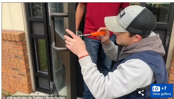
Green Charter's new board swiftly called in a locksmith to change the locks on the main government building