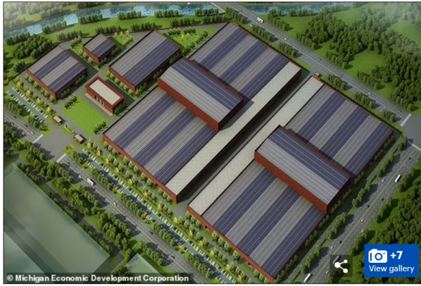
A rendering shows the planned Gotion battery plant in Michigan. The company plans to invest $2.3 billion in the plant and create 2,350 new jobs

In Green Charter, local residents said they were concerned about the planned Gotion plant's possible communist connections.